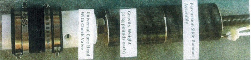
Universal Core Head With Check Valve