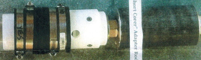
Short Core Adapter Rod