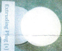
Extruding Plug (s)